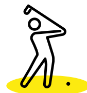
Golf Putting Green